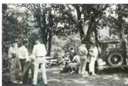
The ice cream brigade at the picnic.