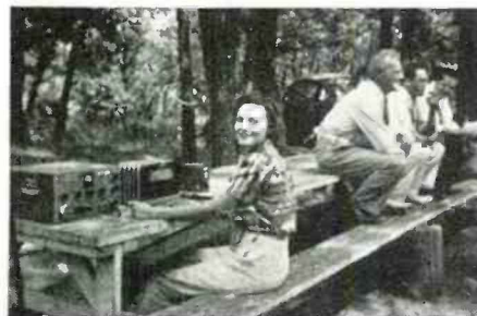
YL looking over W9HKB's gear, with W9KYO and W9GBD chatting in back.